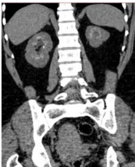
Figure 2: Shows a large calculus in the lower pole of the left kidney

Primary hyperparathyroidism, Type 1 Renal tubular acidosis, Hypervitaminosis, Milk Alkali syndrome, Sarcoidosis, Medullary Sponge kidney are the common causes for Nephrocalcinosis. Of these, Primary hyperparathyroidism has been associated with a fourfold increased prevalence of asymptomatic renal stone disease [5].