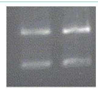
Figure 2: RT-PCR: The lower bands represent the TLR2 mRNA in relation to GAPDH upper control bands on the gel (non- original photo). The semiquantitative assay was done in our study by comparing the relative density of TLR2 mRNA band of each specimen to the band size of the control (GAPDH) using the Image-Pro Plus Version 4.5 (Media Cybertics Co, MD, USA). Intensities were expressed as a percentage of GAPDH expression.

Y axis represents TLR2 mRNA % of GAPDH (control).