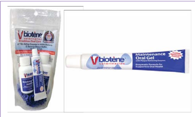
Figure 6: Biotene veterinarian oral care kit and maintenance oral gel.

such as aluminum monostearate, colloidal silica, and xanthan gums. The lubricant properties of the oil make these formulations less adhesive than water bases.