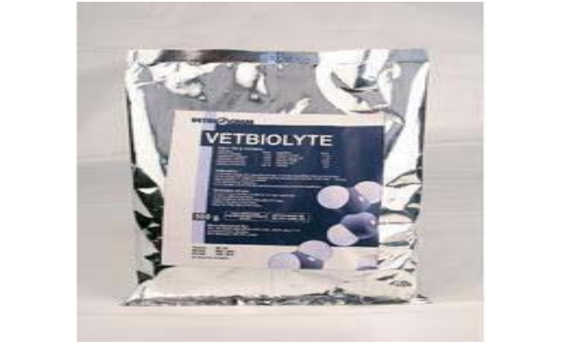
Figure 5: Feed Supplements: VETBIOLYTE.