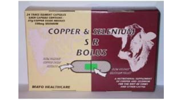
Figure 3: 27g Copper & 500mg Selenium Long Acting, Slow Release, Intraruminal Bolus.

release Copper and Selenium supplementation in bolus form.