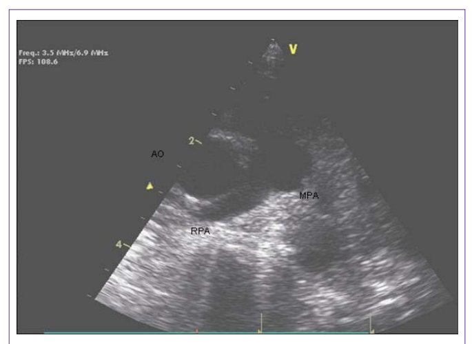
Figure 2 : Echocardiogram at the age of 2 days. Parasternal short axis showing Aorta (Ao) MPA (Main pulmonary artery) and RPA ( Right Pulmonary Artery ) with no evidence to LPA ( Left Pulmonary Artery).

Smadar Eventov-Friedman Austin Publishing Group