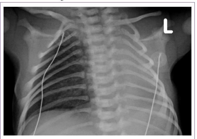
Figure 1 : Chest radiograph performed at the age of day 2, mildly rotated to the right side. The left chest is not aerated and the mediastinum is shifted to the left. The left bronchus cannot be identified. Note normal vascularization and aeration of the right lung.

Arterial blood gases were within normal limits. Chest Radiograph (CXR) showed no sign of air or blood vessels in the left chest. A