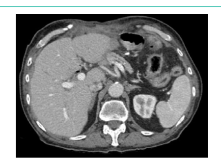
Figure 4: CT scan after 3 months with complete degradation of the stent. A small stent fragment remains (<25%) in the pancreatic duct.