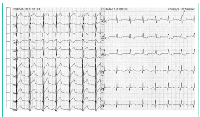
Figure 3: ECG 6 days after last episode of chest pain.