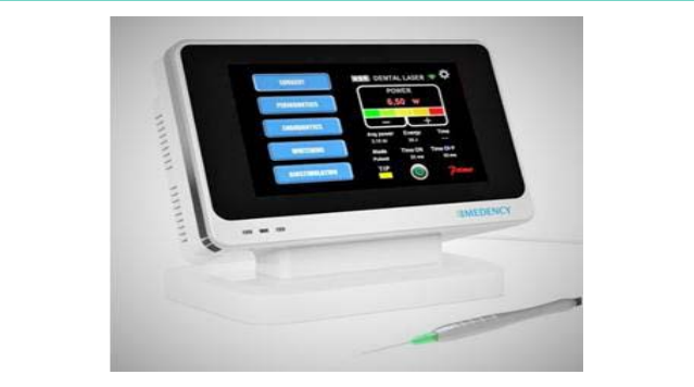
Figure 1: The Diode Laser Device used in the study.

at the mucogingival junction and second horizontal incision at about 10 mm parallel to the first incision. Both these outlines were connected at the distal end of the last tooth.