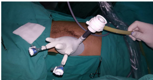
Figure 2: Placing of trocars.