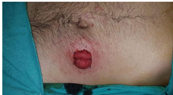
Figure 4: Maturation of ostomy.