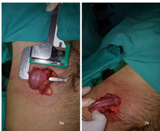
Figure 3: Placing of TA stapler (3a), Stapler line (3b).