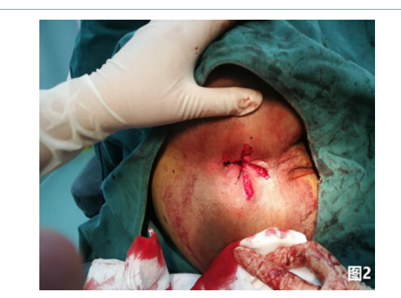
Figure 2: Outside the anus after surgery.