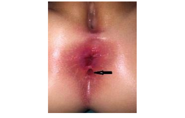
Figure 1: Location of anal duplication.

The duplicated anal canal was exposed with four hanging sutures. Normal saline solution was injected submucosally to promote hemostasis and facilitate mucosal dissection (Figure 3). A mucosal incision was made, and the mucosa was stripped from the underlying muscle as in the Soave operation. The mucosa was removed as a whole (Figure 4). The muscle layer of the duplicated anal canal was quilted with absorbable sutures. Perinoplasty was completed at the end of the operation (Figure 5).