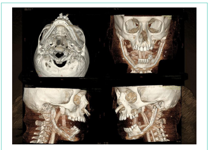
Figure 6: Three month post-operative appearance.

in mandible. From slow and asymptomatic growth, associated with non-aggressive form, which applies to 60-80% of cases that stay unnoticed for a long time, because of their growth inside of the trabecular bone and no pain or neurological disorders. However, migration of teeth can be observed (Figures 4 and 5). To the rarely occurring aggressive type, usually found in 19 to 40% of all CGCG cases, which causes bone mutilation, migration and loss of teeth, root resorption and infiltration of the soft tissues. Frequent symptoms are pain and paresthesia, pathological fractures and recurrences [1,2].