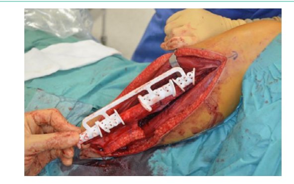
Figure 5: CT after tumors resection and reconstruction.

Central Giant Cell Granuloma (CGCG) is found in 75% in the mandible, usually near the mental foramen, also in the region of molar teeth. In the presented case, the multifocal tumor was detected