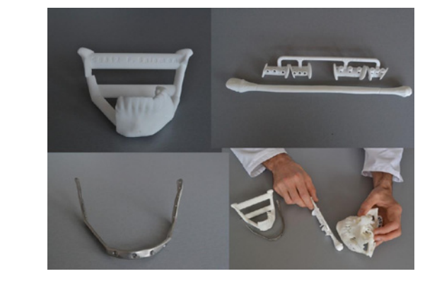
Figure 4: Fibula cutting guides.

was used to provide fibular cutting guidelines and to provide custom contoured plates and splints. The fibula free flap for reconstruction of defects following surgery for giant cell granuloma of the mandible was performed. In this case almost whole mandible without mental protuberance was performed. The fibula osteoseptocutaneous flap was designed with small 2x5cm skin paddle as a survival monitor with isolated about 15 cm peroneal vessel pedicle. Prior to pedicle division the fibula cutting guide was attached to the fibula (Figures 1 and 2). Proximal and distal osteotomies were then performed and connected to the individual titanium plate. A limited neck dissection exposing the facial artery and vein was performed. Using a Gore tunneled, the peroneal vessels were passed down to the exposed neck vessels. After osteosynthesis fibula with mandible the micro vascular anastomosis were performed, connecting the facial artery with the peroneal artery using coupler size 1.5mm, and facial vein with peroneal vein using coupler size 2.5mm. The skin island was sutured as a survival monitor to the sub mental region; he did not require a tracheostomy (Figures 3 and 4). There was no donor site complications. Functional outcome, including mastication, deglutition, and speech was very satisfactory. The boy have intelligible speech and the cosmetic results was excellent. There was no impairment of donor site growth or function.