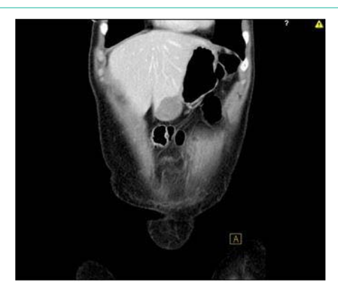
Figure 1: It shows tenderness to palpation in the left lower quadrant.

Hepatic steatosis is mainly a diffuse process but can present in many localized forms such as: multinodular, hypersteatosis, focal geographic, focal nodular, intralesional, perilesional, and subcapsular