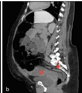
Figure 1: Computed tomography images of the abdomen and pelvis with intravenous and oral contrast showing axial (a), sagittal (b) views of partial large bowel obstruction caused by a post-partum uterus (U), demonstrating a clear transition point at the sigmoid colon (red arrow).

patient remained in the right lateral position overnight, as instructed. On review the following morning, her pain and distension had significantly improved. That same day, her bowels opened twice and repeat abdominal X-ray showed that the large bowel distention had significantly improved. She continued to improve clinically over the next few days and was discharged on post operative day six by the obstetrics team.