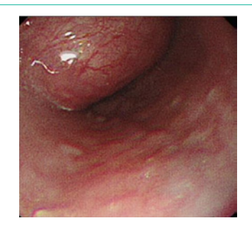
Figure 3: Endoscopic finding showed an esophageal submucosal lesion.

Figure 2: Chest computed tomography showed a heterogenous density mass at lower thoracic esophagus.