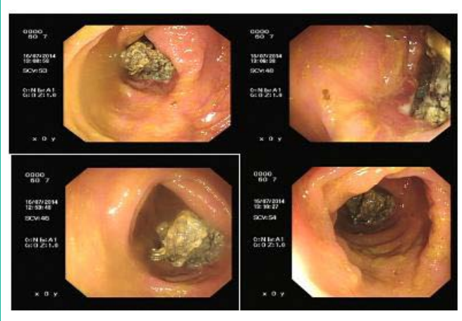
Figure 1: Presence of intra-luminal mesh complex.