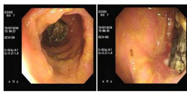
Figure 2: Signs of chronic inflammation.

position is exceedingly rare (Figures 3&4). Erosion into a viscous can be associated with migration or can occur due to mesh's original position. However, when erosion occurs, it can result in infection, abscess, fistula formation or intestinal obstruction.