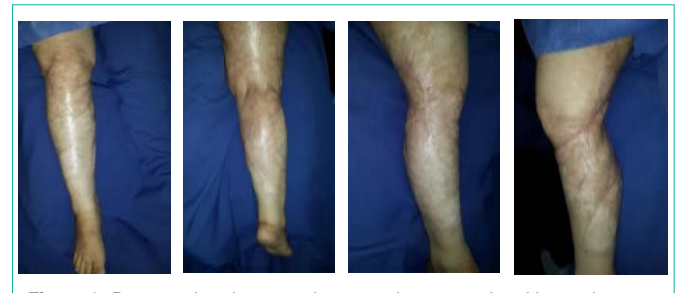
Figure 8: Preoperative view: anterior, posterior, external and internal.

increases with movement and limiting the extension and flexion of the leg (Figure 8).