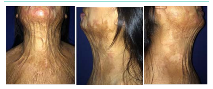
Figure 6: View of the patient 1 month after burn injuries.