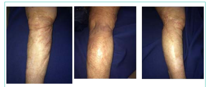
Figure 9: Postoperative view 3 months after the second treatment with fat injection.

clinical developments related to the aesthetic and functional post infiltaction comparatively response with the same preoperative conditions. A functional improvement was proved by direct observation of the surgeons. Who have mainly asked the patients about elasticity of the skin and scar neighboring area, mobility and pain in the affected area? Both patients and surgeons agree that the texture of the skin was the most significant change they experimented in an aesthetic level.