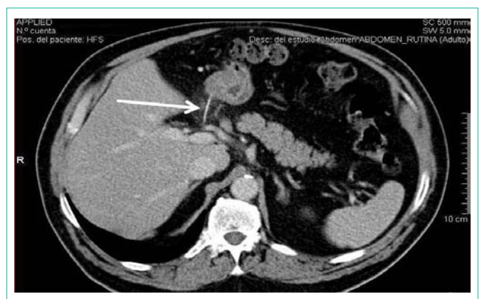
Figure 1: Foreign body (arrow) penetrating the duodenum and extended to the common hepatic artery.