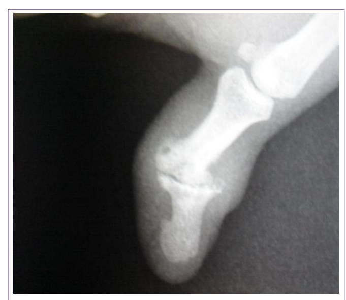
Figure 1: Pre-operative radiograph of left thumb interphalangeal joint showing the deformity.

Surgical treatment for the arthritis of the distal interphalangeal joint (DIPJ) includes arthrodesis and silicone interpositional arthroplasty. For DIPJ arthrodesis by Kirschner wire, cerclage wire or Herbert screw, major complications (non-union, malunion, infection) occurred in 20% of patients, while minor complications (skin necrosis, cold intolerance, proximal interphalangeal joint stiffness, superficial wound infection, or prominent implant) occurred in 16% of patients [1]. One study showed only 4% non-union rate with oblique placement of an AO lag screw [2]. Silicone has been the traditional material used in interpositional arthroplasty for years