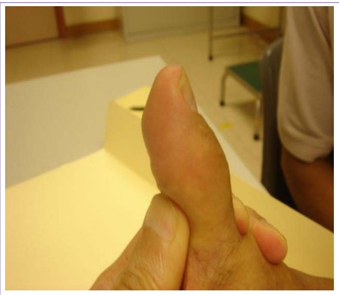
Figure 4: 5 degrees of extension lag at one year post-operatively.

Unlike in patients with primary osteoarthritis, there are a few considerations for the surgery regarding patients with psoriasis. Concentrations of bacteria are greater in psoriatic plaques, but the higher risk of infection is controversial. Lynfield [5] showed that standard perioperative disinfection over the plaques by iodine and alcohol successfully sterilized the plaques in all patients. Wound