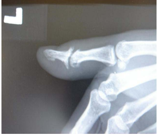
Figure 5: Post-operative radiograph of left thumb at 1 year post-operatively.

healing may be complicated by Koebner phenomenon. However, study showed that psoriatic skin healed at the same rate as normal skin [5]. Studies regarding pre-operative medication management for psoriatic arthritis are lacking, but recommendations can be made based on the studies of rheumatoid arthritis patients. Biologics should be withheld before operation, exact timing depends the half-life of each drug. They can be resumed after stitch removal and when the wound is healing well without features of infection, usually at 2 weeks post-operatively. Methotrexate can be continued because there is a reduction in disease exacerbations without an increase in wound complications [6,7].