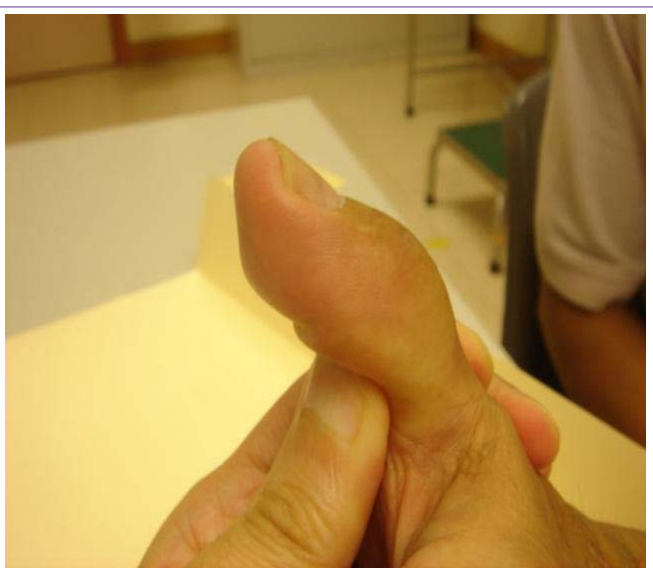
Figure 3: Flexion of 35 degrees at one year post-operatively.

with satisfactory results. In a case series, the average retained range of motion was 33 degrees with satisfactory stability but 10 degrees extension lag [3]. Theoretically, silicone interpositional arthroplasty of DIPJ achieves less pinch power than arthrodesis, although further studies are needed to validate this. Total joint replacement for DIPJ arthritis, though not commonly performed, remains one of the options for treatment. Sierakowski reviewed 131 patients with distal interphalangeal joint arthritis treated by total joint replacement. The patients can achieve a greater range of 39 degrees with the same degree of extension lag. Complications rate was 5% in terms of cellulitis, osteomyelitis, instabilities and deformities [4].