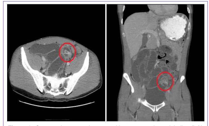
Figure 1: Computed tomography scan with representative axial slice (left) and coronal reconstruction (right) showing dilated loops of small bowel indicative of high-grade SBO. The phytobezoar in the left lower quadrant (circled) was originally interpreted as possible intussusception.

Here, we describe the case of a young man with Meckel's diverticulum and phytobezoar-induced SBO occurring 3 weeks after adoption of the Paleolithic diet. Our patient recently adopted the Paleolithic diet in the setting of a Meckel's diverticulum that was not uncovered until exploratory laparotomy. Both of these factors likely contributed to the development of obstructive phytobezoar. The Paleolithic diet, which is becoming increasingly popular due to purported benefits to waist circumference and metabolic parameters [2], emphasizes vegetables, fruit, roots, nuts, seeds, and meat while excluding grains, legumes, and dairy. As of 2013, an estimated 1-3 million Americans were adherent to the Paleolithic diet [3], and it