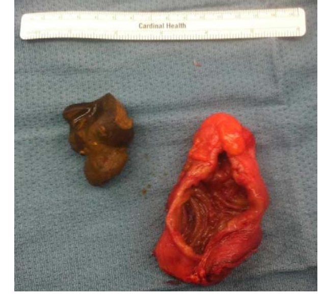
Figure 3: Phytobezoar and opened diverticulum post resection.

was the most searched-for diet of the year on Google [4]. Likewise, Meckel's diverticulum is common: at 2% prevalence, it is the most frequently encountered congenital abnormality of the GI tract. While usually asymptomatic, Meckel's diverticula occasionally cause bleeding, obstruction due to volvulus or intussusception, or diverticulitis.