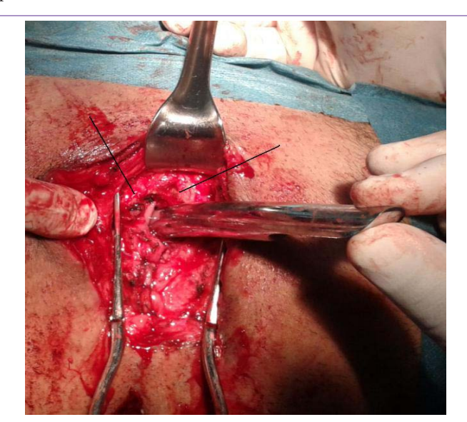
Figure 3: Anal reconstruction with Hagar dilator in distal rectum and the external sphincter muscle shown at tip of lines.

He was then discharged home on pelvic floor exercises to strengthen the reconstructed sphincter. Three months later he presented and could hold an enema well for more than 3 minutes.