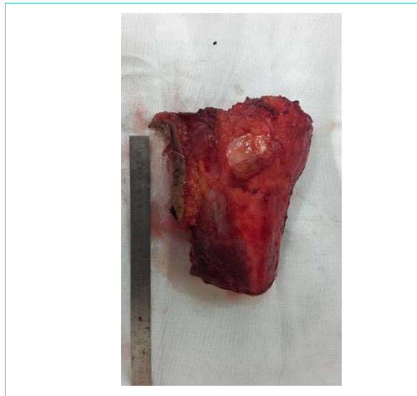
Figure 10: Proximal tibia resection piece.