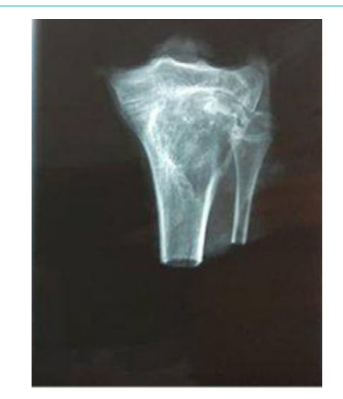
Figure 11: Proximal tibia resection piece.