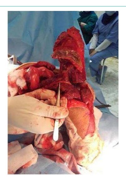
Figure 7: The primary tumor was en bloc resected, which included the proximal tibiofibular joint and the upper end of the fibula.

the biopsy scar was used. The anterior tibialis muscle is exposed. Its perimysium is opened and the muscle is retracted laterally, leaving the inner layer of the perimysium attached to the tibial periosteum, in order to preserve the wide margin of tumor resection. The neck of the fibula is identified and the common peroneal nerve is dissected.