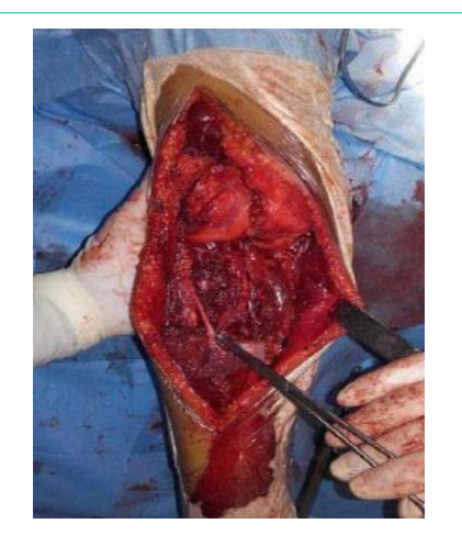
Figure 8: The primary tumor was en bloc resected, which included the proximal tibiofibular joint and the upper end of the fibula.