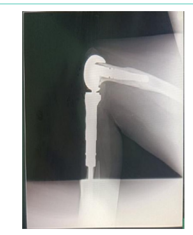
Figure 15: Fracture on prosthesis on femoral side consolidated after three months of orthopedic treatment with good knee mobility.