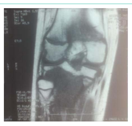
Figure 5: Magnetic Resonance Imaging (MRI) show an upper metaphysoepiphyseal lytic lesion of the tibia right, measuring 45'38 mm in the transverse plane extended by approximately 52 mm in height.