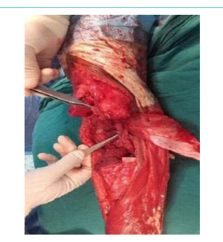
Figure 9: The primary tumor was en bloc resected, which included the proximal tibiofibular joint and the upper end of the fibula.