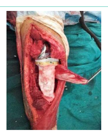
Figure 12: A medial gastrocnemius flap is transposed to repair the extensor mechanism by direct suturing of the patellar tendon and to cover the custom prosthesis.