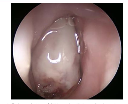
Figure 1: Endoscopic view of right nasal cavity tumor has been demonstrated.

Otherwise healthy three years old male patient was admitted to our tertiary center Otorhinolaryngology department with the complaint of nasal obstruction and hearing loss. Nasal obstruction has increased for three months and sleep apnea was well recognized by his parents for ten days. On his physical examination; there was a solid mass in the right nasal cavity filling also nasopharynx (Figure 1). On otoscopic examination; there was serous otitis media with airfluid levels in right ear. Maxillofacial and neck magnetic resonance imaging (MRI) revealed a 3x2 cm. solid mass in right nasal cavity