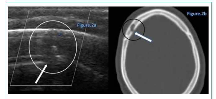
Figure 2: 22 –years old man referred to ultrasound due to soft thinning area of bone on the right frontal scalp.

Figure 2a: Doppler US of right frontal bone show 1 cm hypo echoic mass (circle) without flow and show the defect in the internal part of diplopic of bone (arrow).