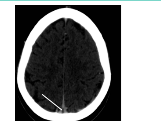
Figure 4: The same patient in figure 3. Fenestration of the superior sagittal sinus (arrow).

There is a wide range of clinical presentations of patients with atretic cephaloceles. A child may be completely normal with regard to neuro-developmental milestones, or may have severe mental retardation if the atretic cephalocele is associated with severe intracranial anomalies, such as malformations of cortical development, Walker-Warburg syndrome, agenesis of corpus callosum and/or ventriculomegaly. However NTDs are potentially serious congenital malformations. If undiagnosed in childhood, such lesions may later be mistaken for a variety of other soft tissue abnormalities. The proper identification of these lesions is important because NTDs may communicate directly with the central nervous