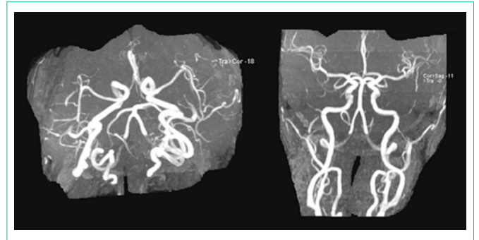
Figure 2: MRA on 20th day shows patent posterior circulation.

The patient's pyramidal symptoms improved quickly, in contrast with his other symptoms of bilateral thalamic infarction, such as his reduced level of consciousness, which continued to progress after admission. To achieve a thorough understanding of the staggered symptoms and signs observed in this patient, it is necessary to review the blood supply of the bilateral thalami