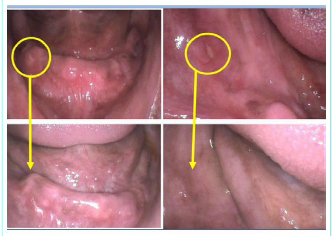
Figure 3: Clinical appearance of medication-related osteonecrosis of the jaw. Two areas of the exposed bone were visible on the patient's right hemimandible, as indicated by the circles.