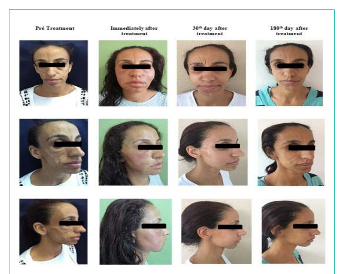
Figure 4: Patient in the pre-treatment and serially until the sixth month in maintenance of the results.

The patient was discharged from hospital 24 hours after the