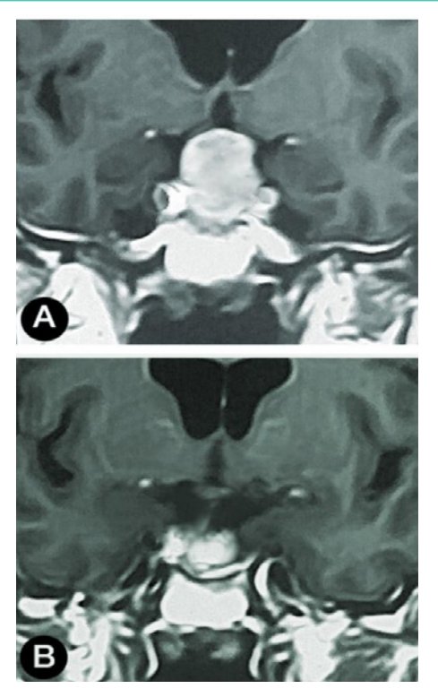
Figure 2: (A) MRI pituitary before treatment showing macroprolactinoma with para – and supra-sellar extension compressing the optic chiasm. (B) MRI of the same pituitary region with significant tumor reduction after 6 months of treatment with QIN (up to 150µg once daily).