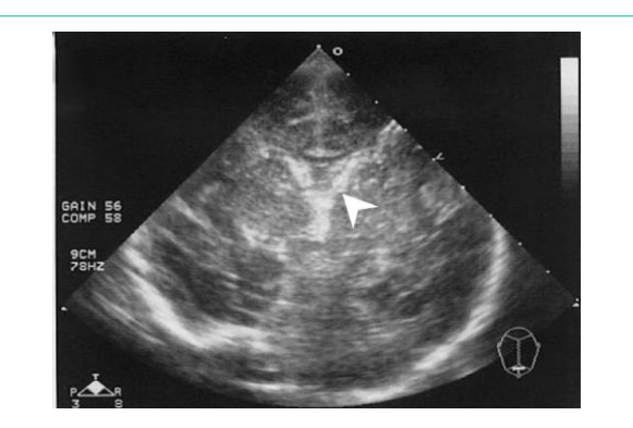
Figure 1: Brain sonography showed grade II, bilateral intraventricular hemorrhages.