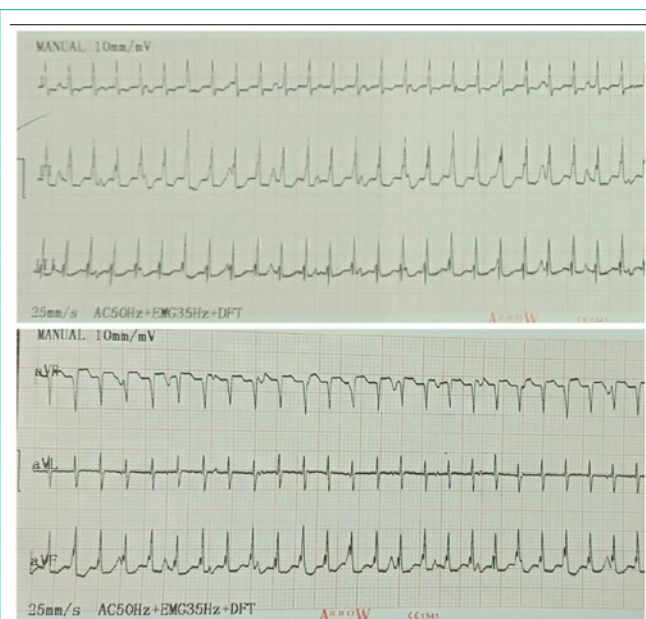
Figure 1: Electrocardiogram of the index case showing a narrow complex tachycardia with atrioventricular dissociation suggestive of congenital junctional ectopic tachycardia.

Congenital JET is a rare tachyarrhythmia first reported by Coumel, et al in 1976 [5]. Neonates present with congestive heart failure and echocardiographic evidence of left ventricular dysfunction