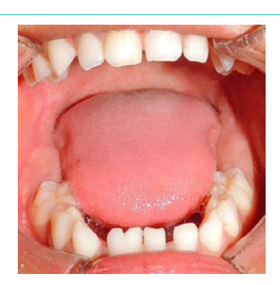
Figure 7: Postoperative view.

A reconstruction of tissues by planes was performed, (Figure 4) a nasogastric tube was placed for feeding. Subsequent to this, thyroid hormone replacement therapy begins, favorably evolving to such treatment without complications.