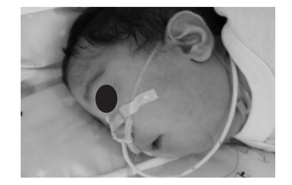
Figure 3: Infant of 3 months old with Pierre Robin Sequence.

During the 90's, bone distraction begins to be practiced in the maxillofacial territory. McCarthy [18], Molina and Ortiz-Monasterio [19], and Guerrero [20] make the first efforts to achieve growth