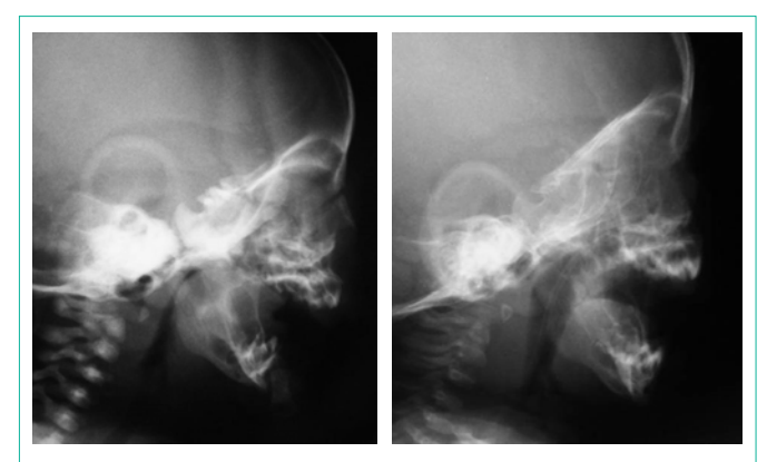
Figure 8: Left, preoperative radiography; Right, postoperative radiography.

At the end of the activation period, the patients gained a normal respiratory physiology, with complete horizontal positioning of the tongue (Figure 7), and a larger U.A. area (Figure 8) with an average of 18.8mm of distraction. Gastroesophagic reflux was cured; witch was comprobated with a pH measurement. Adequate oral nutrition was achieved with the prior help of suction stimulation through a pacifier and feeding bottle. The maxillo-mandibular relation was corrected