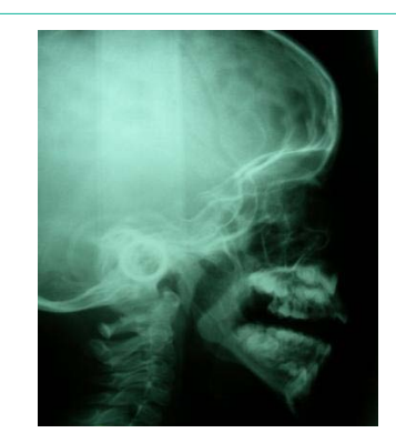
Figure 12: A teleradiography four years after.

initiating activation should be 5 days, keeping, and a rhythm every 12 hours during traction. He puts emphasis, in those patients too young, activation should be of 1,5mm daily, due to their great metabolic potential and the risk of premature consolidation. Molina [19] recommends 5 days as the latent period, after which he continues with distraction of 1mm every 24 hours. Denny [23], when presenting a series of 6 patients with obstructive airway disorders, to whom he had performed osteogenic distraction, started activation the next day of the intervention, with a rhythm of 2mm daily for the first 3 days. When analyzing the different reports, we decided to wait 3 days, in order to allow a clot to form in the osteotomized zone. Then activation was started with 1mm every 12 hours to allow a greater initial advance with the major aim of quickly dealing with the obstruction of the U.A. Distraction was every 12 hours rather than every 24 hrs, because this diminishes the separation magnitude of the two segments during each activation, lowering pain.