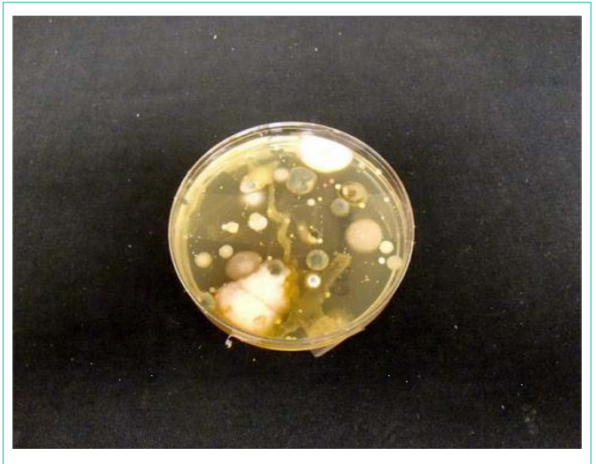
Figure 2: This figure shows the SDA agar plate demonstrating the fungal colonies that appeared following culturing of the nasal swab sample for 5 days in the dark at room temperature. The number of colonies of each fungus ranged from as low as one ( Microsporium ) to nine ( Rhodotorula ). The bacteria and Candidia were TNTC.

Table 1: Bacteria and Fungi cultured from the nasal mucosa of the ethmoid sinus. The number of colonies of each fungal colony observed on the SDA agar plate ranged from 1 to TNTC, while the bacteria were too numerous to count.