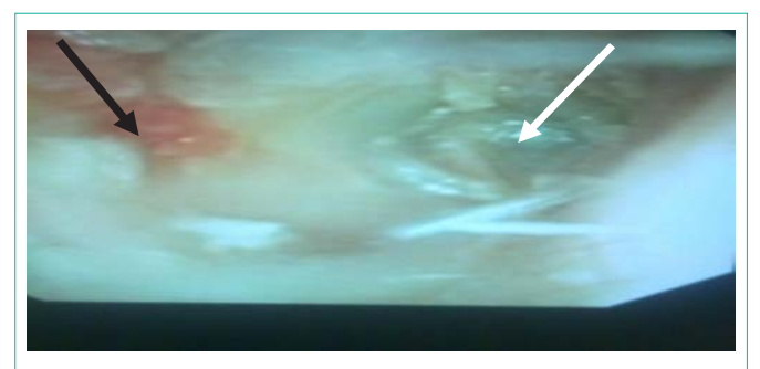
Figure 2: Endoscopic photograph showed thickening of the left tympanic membrane (white arrow) and global widening of the EAC with anteriorly located granulation tissue (black arrow).

Citation: Al-Juboori AN. Keratosis Obturans: A Rare Cause of Facial Nerve Palsy. Austin J Otolaryngol. 2015;2(4): 1039.