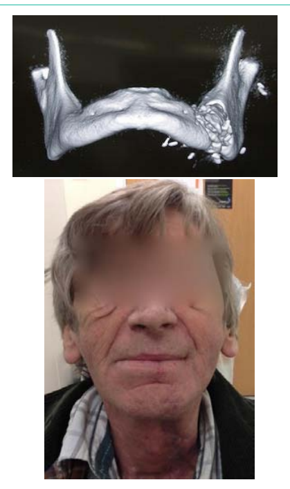
Case 4: Good aesthetic outcome following fibula free flap reconstruction of a Notani grade III defect.

The subscapular system of flaps is unique among all free flap donor sites because of the reliability, diversity of tissue type, potential surface area that can be transferred and the mobility of the soft tissue component in relation to the bone. There is no need for any flap related workup and the donor site morbidity is minimal. The relative sparing of scapular vessels from atherosclerotic disease makes them an excellent choice when a fibular free flap is contraindicated [56]. The flap may be raised in a chimeric fashion. The lateral border of the scapula can be included based on the transverse branch or the angle of the scapula included based on the angular branch of the circumflex scapular artery. The pedicle length can extend up to 10cm in when harvested on the angular branch. The subscapular system free flaps are excellent options for elderly patients, those with significant comorbidities, such as peripheral vascular disease and mandible defects associated with complex soft-tissue requirements and