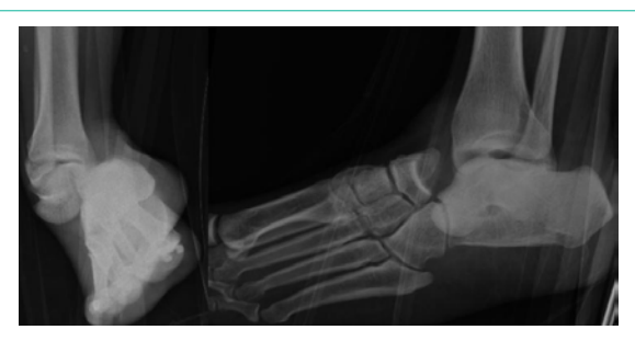
Figure 2: Antero-posterior and lateral radiographs of the right ankle showing an isolated medial subtalar joint dislocation with the calcaneus and the rest foot dislocated medially in relation to the talus.