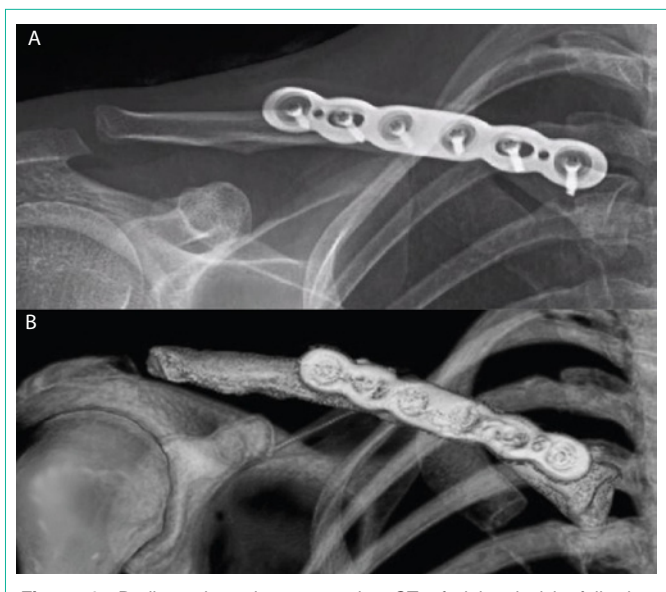
Figure 2: Radiograph and postoperative CT of right clavicle following corrective osteotomy with autologous bone grafting and superior plate fixation of right clavicle.

alignment with restoration of the clavicular length in comparison to the contralateral clavicle with correction of her cosmetic deformity (Figure 3). She followed a progressive physical therapy protocol following surgery begin with 4 weeks of sling immobilization followed by progressive range of motion and strengthening monitored by physical therapy. She reported recovery of full shoulder function at 6 months postoperative and at final follow up at 1 year, she experienced no complications from surgery.