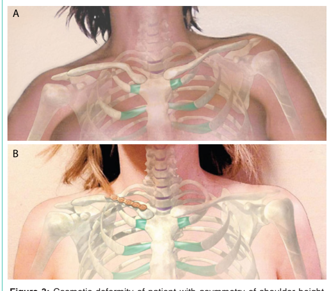
Figure 3: Cosmetic deformity of patient with asymmetry of shoulder height (A) compared with shoulder appearance following corrective osteotomy (B).

Potter et al. [13] concluded that although immediate surgical fixation of clavicle fractures has better results and can help prevent the development of the sequela from malunion, corrective osteotomies are an option in patients initially treated with non-operative