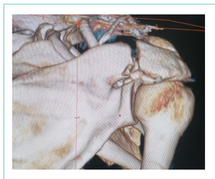
Figure 3: A. 3D-reconstruction image showing Kuhn type III acromion fracture associated with subacromial space narrowing.