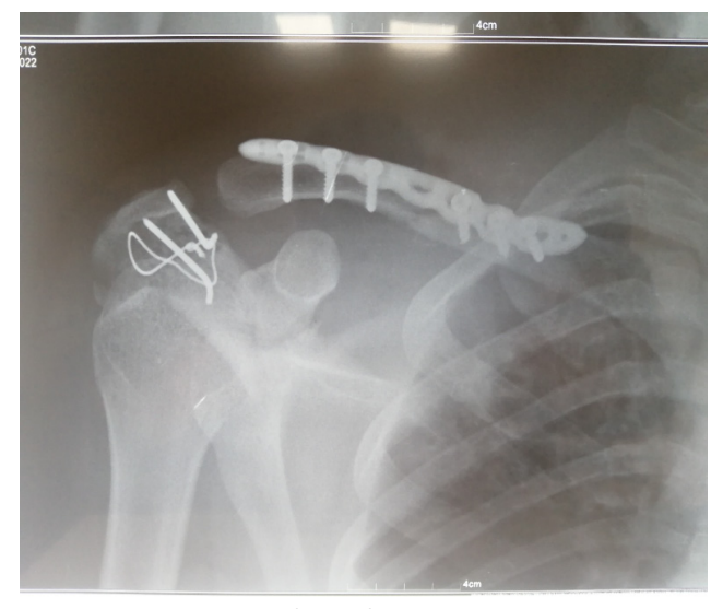
Figure 4: postoperative radiograph.