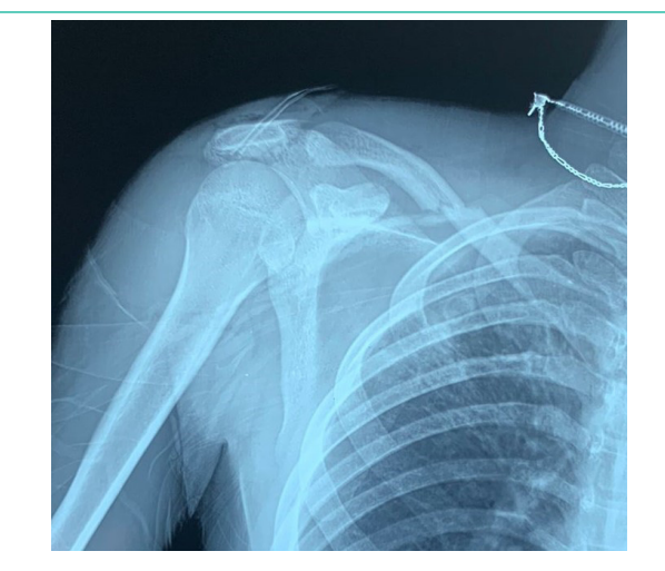
Figure 1: clinical image 2 weeks post-operatively showing scares of shoulder wound, dermabrasion at impact point and incision wound for acromion ORIF.

good clavicle and acromial fixation tested under direct vision and fluoroscopic view, the coracoid process was satisfactorily reduced and stable without any other surgical step (Figure 4).