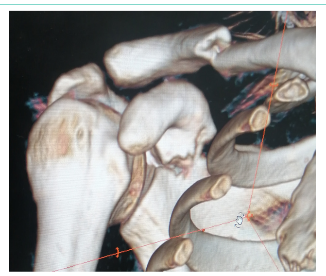
Figure 3: B. 3D-reconstruction image showing Ogawa type I coracoid fracture and mid-shaft clavicle fracture with normal coracoclavicular distance.