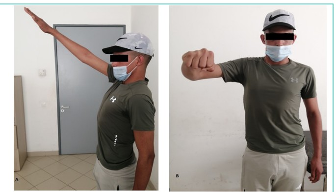
Figure 7: A: Antepulsion B: Abduction;