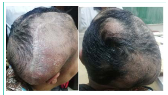
Figure 4: Clinical tumor regression after radiotherapy.

proliferation was 30% in hot-spot zones. Finally, we don't find actin and desmin expression excluding the diagnosis of leiomyosarcoma.