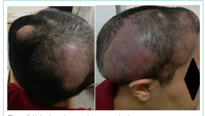
Figure 2: Voluminous increased temporoparietal mass.

were irregular and the nucleocytoplasmic ratio was high. Cellular anaplasia was severe with the presence of atypical nucleus tumor cells. This concluded into aggressive anaplastic meningioma recurrence with infiltration of adjacent bone and adjacent glial parenchyma. The immunohistochemically study revealed cell Epithelial membrane antigen (EMA), Vimentin and PS100 cell expression. The Ki 67 index