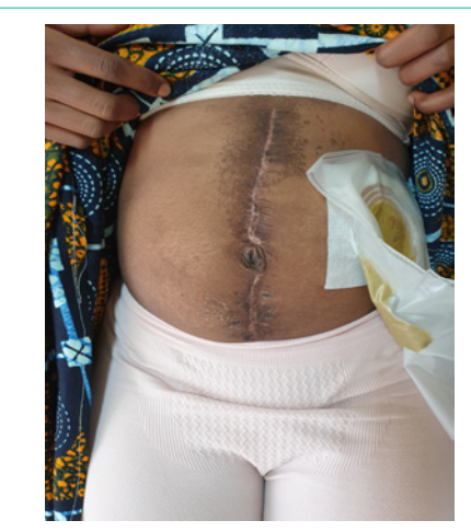
Figure 3: Healed midline incision with colostomy in situ.

whole blood intra-operatively. Her control hemoglobin was 11.5 g/dl day two post operatively.