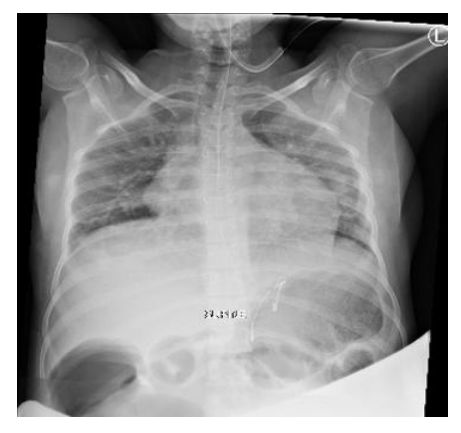
Figure 4: X-ray showing no chest abnormalities with some dilated loops.

Two months later, she was admitted to the surgical unit for an elective closure of her colostomy. Her haemoglobin was 11.2~g/dl