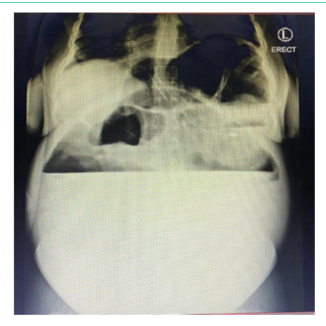
Figure 1: Erect abdominal X-ray showing large air-fluid level suggestive of intestinal obstruction.

The obstetrics team was consulted and an obstetric ultrasound reported a live singleton intrauterine pregnancy at gestational age of 24 weeks and 3 days, adequate liquor and fetal heart rate of 139 bpm. A decision for expeditious laparotomy was reached after joint discussion (Obstetricians and Surgeons). Intra-operatively, a gravid uterus with 500mls of amber colored ascites was encountered. A 360 degrees anticlockwise sigmoid volvulus was found twisted around its gangrenous mesentery and grossly distended (Figure 2). The stomach, small bowels, caecum, ascending, transverse and descending colon were distended. The volvulus was untwisted, sigmoid colon resected and hartmann's colostomy raised. The patient received 450mls of