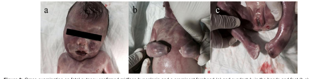
Figure 3: Gross examination on fetal autopsy confirmed midface hypoplasia and a prominent forehead (a) and syndactyly in the hands and feet (b,c).

CNS, cardiac or urogenital malformations. In the case described here, the fetus had the characteristic malformations of Apert syndrome, and neither ultrasound nor autopsy detected malformations in other sites.