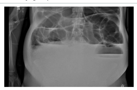
Figure 3: Upright plain abdominal film demonstrating massive dilation of the transverse colon and small bowel air/fluid levels. The pregnant uterus has displaced the abdominal contents cephalad.

The most common causative factors of small and large bowel obstruction in pregnancy include adhesions (58%), volvulus (24%)