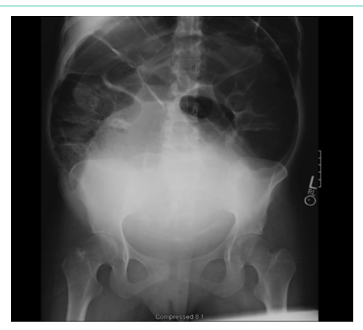
Figure 1: Plain abdominal X-ray at 31 weeks gestation demonstrating a large dilated colon loop and a fetus in the maternal pelvis.