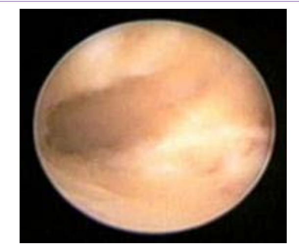
Figure 4B: Hysteroscopic lysis of adhesions restoring normal uterine cavity anatomy.