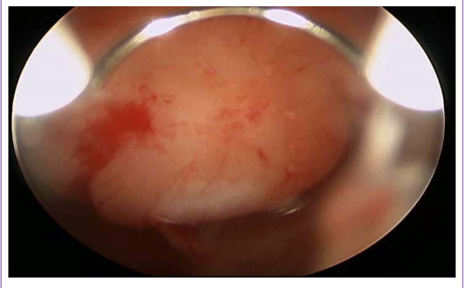
Figure 1A: SubmucousMyoma.

In 2008, Pritts et al. published a meta-analysis of 23 studies evaluating women with fibroids and infertility. Nine of the 23 studies looked at sub mucosal fibroids. Six studies were retrospective, 2 prospective and 1 was a randomized control study. When looking at infertile women with sub mucous fibroids in comparison to infertile