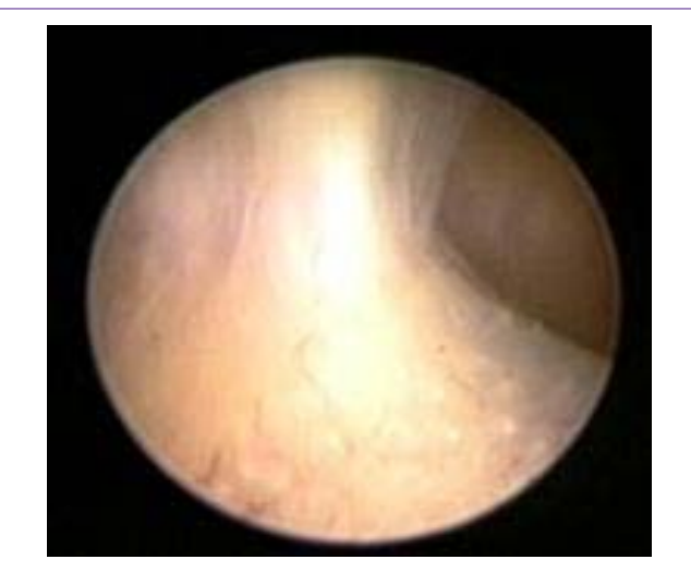
Figure 4A: Intrauterine adhesions blocking the right tubal ostia.

When looking at severe adhesions, Cappella-Allouc and