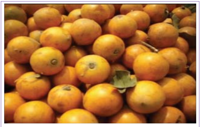
Plate 1: African Star Apple

Matured, semi-ripe purple star apples, ( Chrysophyllum cainito ) used for this research work were obtained from St. Thomas Acquinas Catholic Church, FUTO. Matured ripe African star apples ( Chrysophyllum delevoyi ) and fresh pineapples were purchased from Ekeonuwa market in Owerri Town, Imo State, Nigeria. The chemicals used were of analytical grade and were obtained from the Department