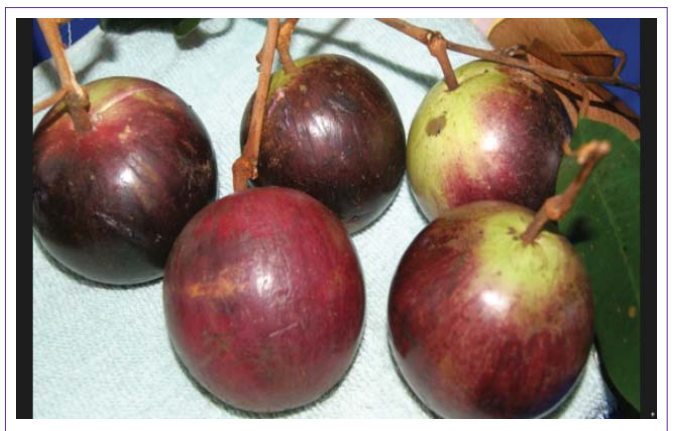
Plate 2: Purple Star Apple

of Food science and Technology, Federal University of Technology Owerri. The equipment and other materials used were obtained from the Departments of Food science and Technology and Crop science and Technology, Federal University of Technology Owerri, Imo State, Nigeria.