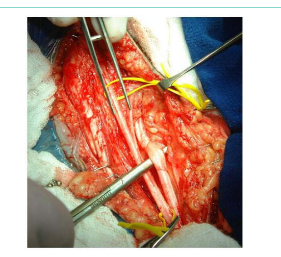
Figure 1: A 64-year-old patient with traumatic neuroma, victim of car trauma with injury of the left common peroneal nerve. At admission, the patient presented with grade 0 strength on his left foot. He underwent neurolysis 3 months after trauma and evolved with complete strength recovery at 6-months follow-up.

Regardless of diagnose, 50% of the patients were diagnosed with traumatic neuroma (Figure 1) and 21.43% with ganglion cyst (Figure 2), as shown in Table 3.