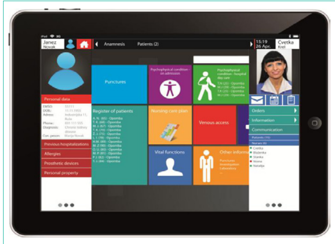
Figure 1: Main menu window