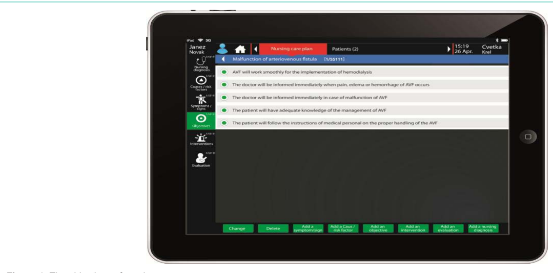
Figure 4: The objectives of nursing.