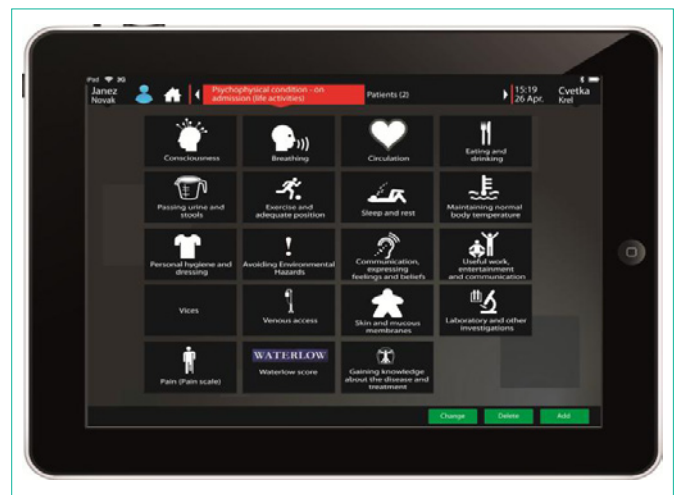
Figure 2: Psychophysical condition - on admission (life activities).