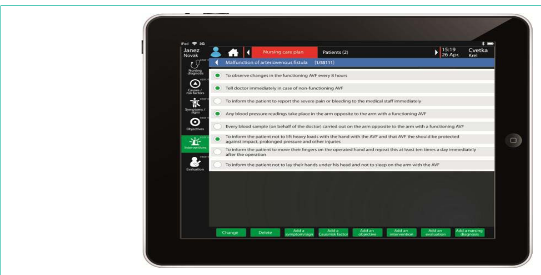
Figure 5: Planning interventions.