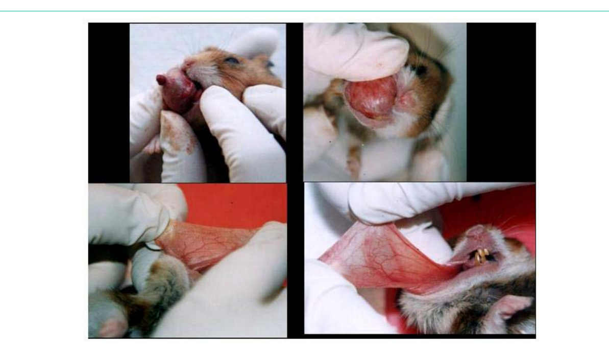
Figure 1: Effect of GB-10-BNCT on tumor and normal pouch tissue 7 days post-treatment (pouches have been everted for observation).