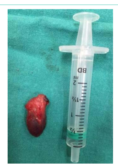
Figure 3: Surgical specimen of the resected ectopic upper pole parathyroid lesion measuring 15x10x4mm.

we can confirm a parathyroid lesion, however if it is located anteriorly, it may be due to an intrathyroidal parathyroid lesion or a false positive finding of a thyroid nodule. In this instance Tc-99m Pertechnetate thyroid imaging will be helpful in deciding if a lesion is due to an intrathyroidal lesion versus a thyroid nodule. If the lesion is in an ectopic location, more accurate anatomical localization is obtained. SPECT/CT is more reproducible as compared to ultrasound, which