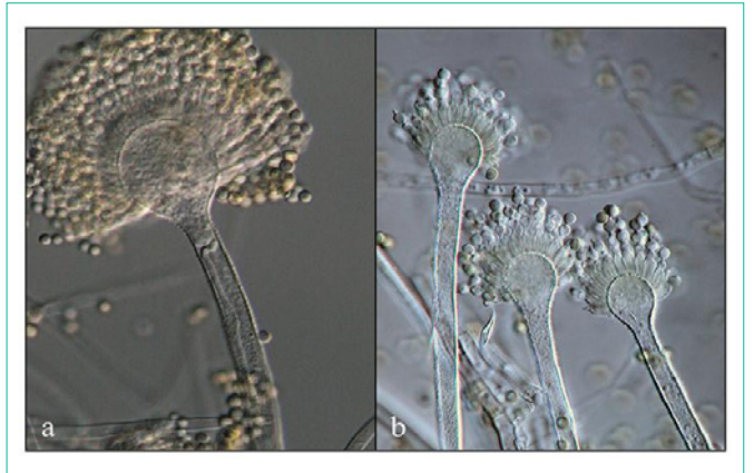
Figure 1: (a) Bi-seriate and (b) mono-seriate heads of A. flavus.

The IPCC [4] (Eds) reports that the world's land ecosystems act as a major sink in the contemporary global carbon cycle and, therefore it alleviates the rise of atmospheric CO_2 concentrations from global CO_2 emissions and as a consequence there is an overall effect on climate change.