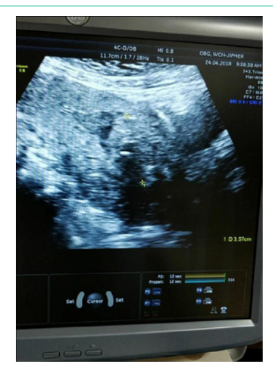
Figure 5: Trans abdominal 2-D scan shows the fund us of uterus with resolution of ectopic in lower uterine segment after 7 days of evacuation.