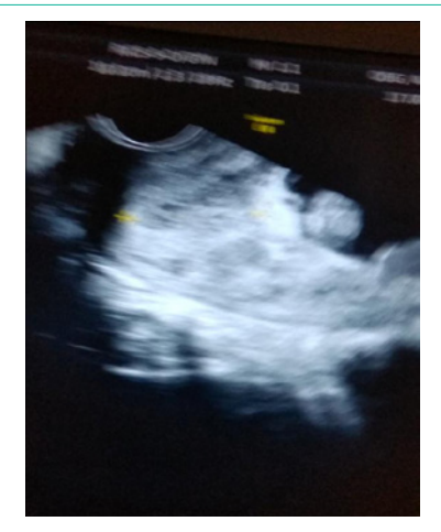
Figure 2: Transvaginal 2-D scan; shows the Fundus of uterus which is empty with part of gestational sac lining.

Subsequent USG showed empty fund us and bulging and enlargement at the lower part of uterus (isthmus) with gestational sac and the cervix was short and the internal Os was not delineated. Hence a diagnosis of cervico-isthmical pregnancy was made and she received 2 Cycles of Variable dose methotrexate along with Mifepristone and underwent uterine artery embolization. After 42 days the vascularise persisted Figure 1 and her serum \beta HCG declined to 88 m IU/dl. From 28,000 IU/d. She underwent instrumental evacuation and received 3^{\rm rd} course of variable methotrexate along with mifepristone. Subsequent resolution and confirmation of cervico-isthmical pregnancy is shown in Figures 2-5.