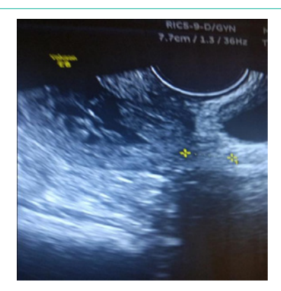
Figure 4: Transvaginal 2-D shows the lowermost part of the uterine cavity to delineate the cervix (Calipers).