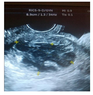
Figure 3: Transvaginal 2-D scan shows the bulge due to blood clots in the lower uterine segment 2 days after evacuation.