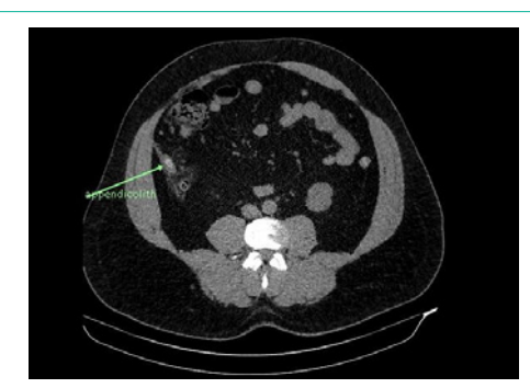
Figure 3: Axial view of the abdomen with appendicolith present.