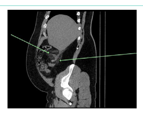
Figure 2: Saggital view of the abdomen.